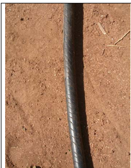
Main tube with slots of filter made with a hacksaw