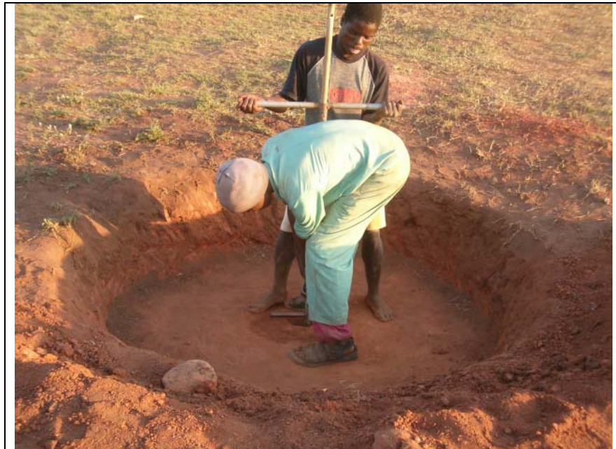
Making a borehole for the tube recharge system with a step Auger in Chimoio Mozambique, June 2006