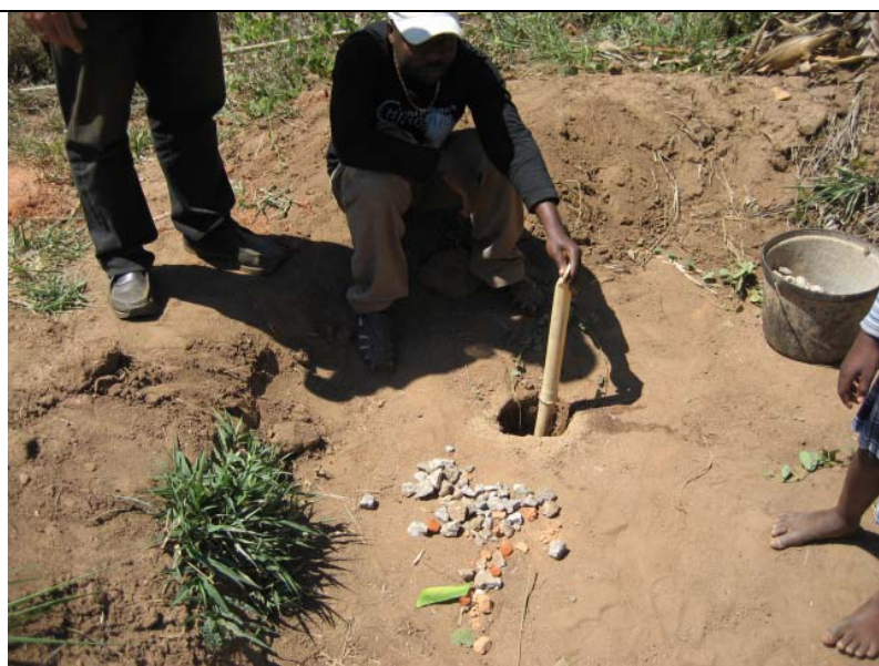
The system has been inserted and gravel can be added plus clay to seal it of.