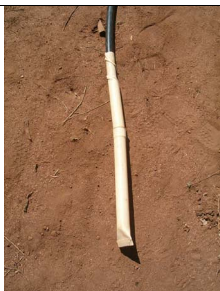
The system in closed position